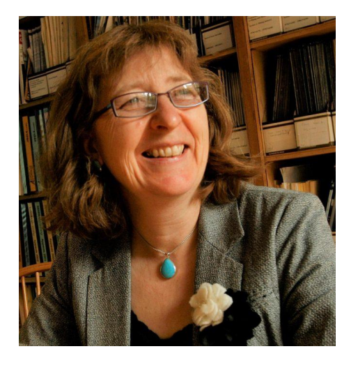
President of the Geological Society of London